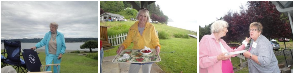
Scenes from our July Picnic at Sea Cliff