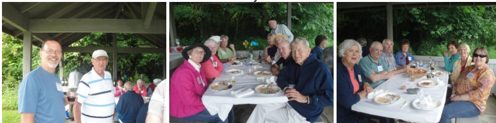
Great food! Great friends! Great weather? 2 out of 3 ain't bad!